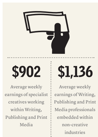
Valuing Australia's Creative Industries 2013, CIIC

Challenges specifically impacting the publishing sector: